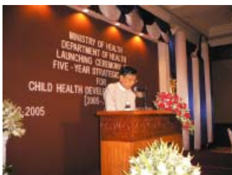
HE Prof Mya Oo, Deputy Minister of Health, speaking at the launch of the national five year strategic plan for child health development, Grand Plaza Park Royal hotel, Yangon

The Ministry of Health launched the Five Year Strategic Plan on Child Health Development at Yangon on 7 February 2005. Prof Mya Oo, Deputy Health Minister, chaired the launching ceremony attended by high ranking staff of the Ministry