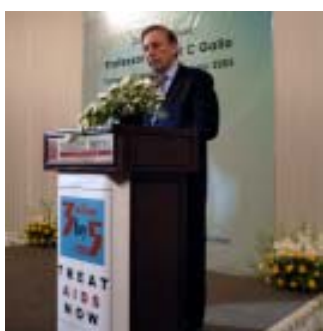
Professor Robert C Gallo at Traders hotel, Yangon, 1 February 2005

Professor Robert C Gallo, Director, Institute of Human Virology, University of Maryland, USA, visited Myanmar from 31 January to 4 February 2005. The eminent scientist became famous when he co-discovered with Prof Luc Montagnier that