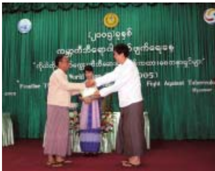
HE Prof Kyaw Myint, Minister of Health, presenting an award of recognition to an outstanding township medical officer at World Stop TB day ceremony.

World TB Day, 24 March 2005, was commemorated in Myanmar under the motto "Frontline TB care providers: heroes in the fight against tuberculosis".