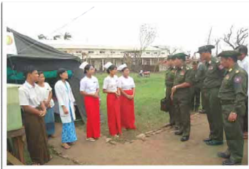
Chairman of the State Peace and Development Council, Senior General Than Shwe inspecting the provision of Health Care at the areas affected by Cyclone Nargis affected area and giving guidance