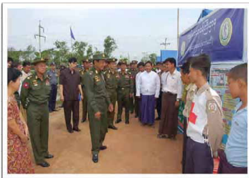
Vice Chairman of the State Peace and Development Council, Vice Senior General Maung Aye inspecting the Health Clinics at areas affected by Cyclone Nargis affected area and providing necessary instructions